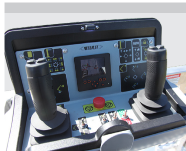
Automatic outrigger setup and packing