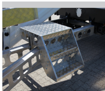
Aluminium steps to the bucket