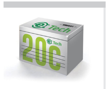
Lithium-Ion power pack (optional)